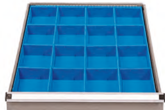
Different combination of containers in use.